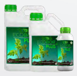
ECOBOR PLUS + Organomineral Base Fertilier 1 LT , 5 LT , 10 LT