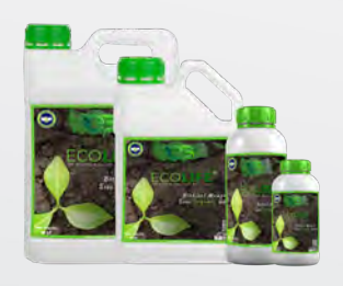
ECOLIFE Organic Foliar Fertilizer 500 ML , 1 LT , 5 LT , 10 LT