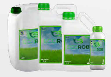
ECOROB Organic Foliar Fertilizer 1 LT , 5 LT , 10 LT , 20 LT