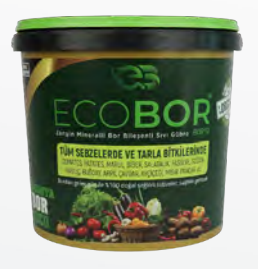
All Vegetables and In Field Crops 10 LT